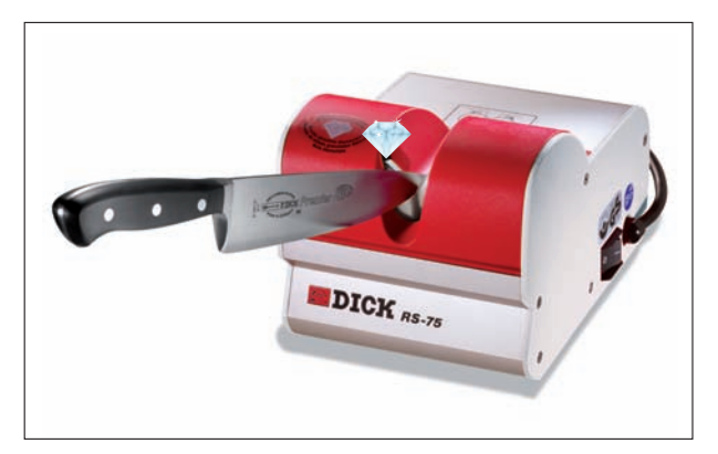
Sharpening Machine DICK RS-75

As leading knife manufacturer DICK is certainly competent regarding the sharpening of all types of knives. There are many different requirements for how a knife blade can be ground. DICK offers individual solutions e.g. for canteens and supermarkets: