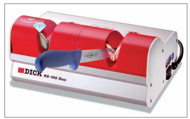
Sharpening and Honing Machine – for highest demands DICK RS-150 DUO

You can receive detailed information about our large range of Sharpening and Grinding Machines upon request.